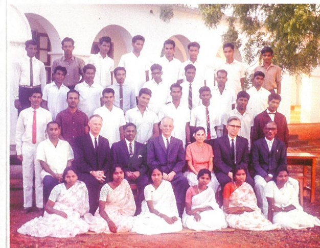
The One Year Class at Concordia Seminary in Nagercoil (1968).

and serve tens of thousands of Christians in hundreds of congregations throughout Tamil Nadu, Kerala, and Sri Lanka.