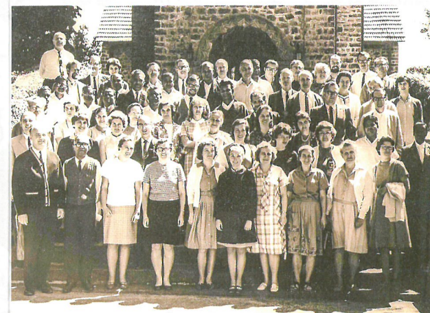
Participants at the MELIM Executive Committee Conference in June, 1970 at Kodaikanal.

and serve tens of thousands of Christians in hundreds of congregations throughout Tamil Nadu, Kerala, and Sri Lanka.